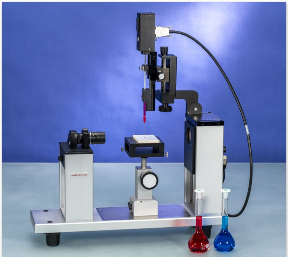
OCA 11 with SD-DM/2 and ESr-N

The OCA 11 is upgradable to the more advanced OCA 15EC . For more information on the OCA product series of optical contact angle measuring and contour analysis systems please refer to the corresponding brochure or website.